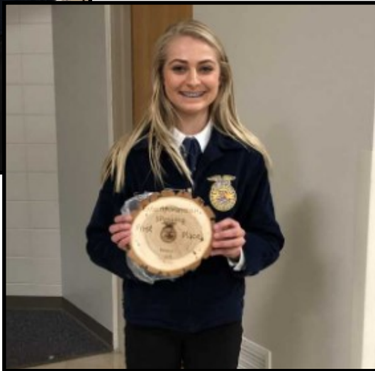
Eight Garretson FFA members (two teams, one individual) advanced to state based on their finishes at the district contest this week.