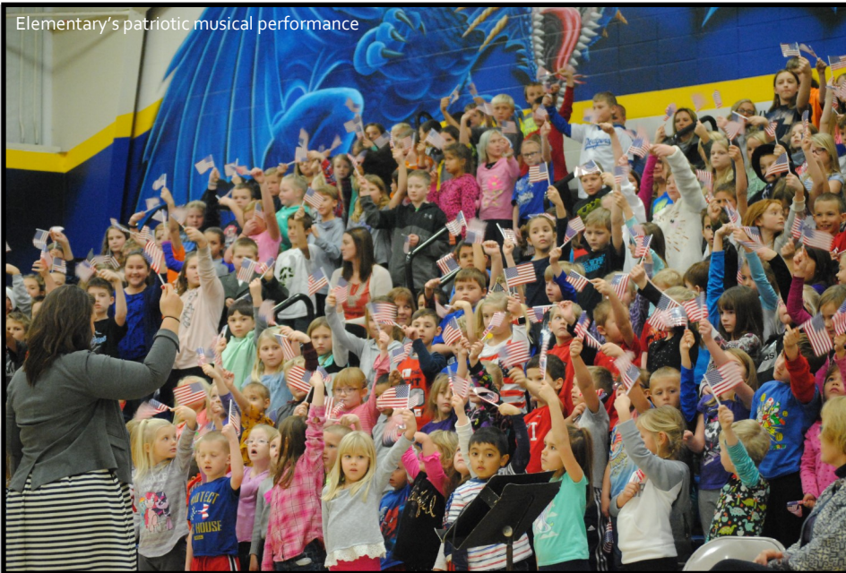
Elementary's patriotic musical performance

The middle school choir students and elementary students each performed musical selections. Elementary students acted out a selection from a book that focused on impactful people in US history.