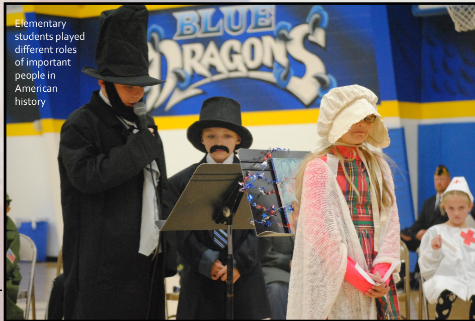
Elementary students played different roles of important people in American history